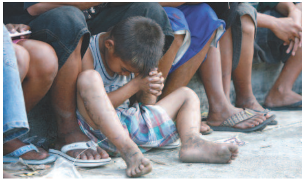
Church workers befriending street kids who are sniffing glue.